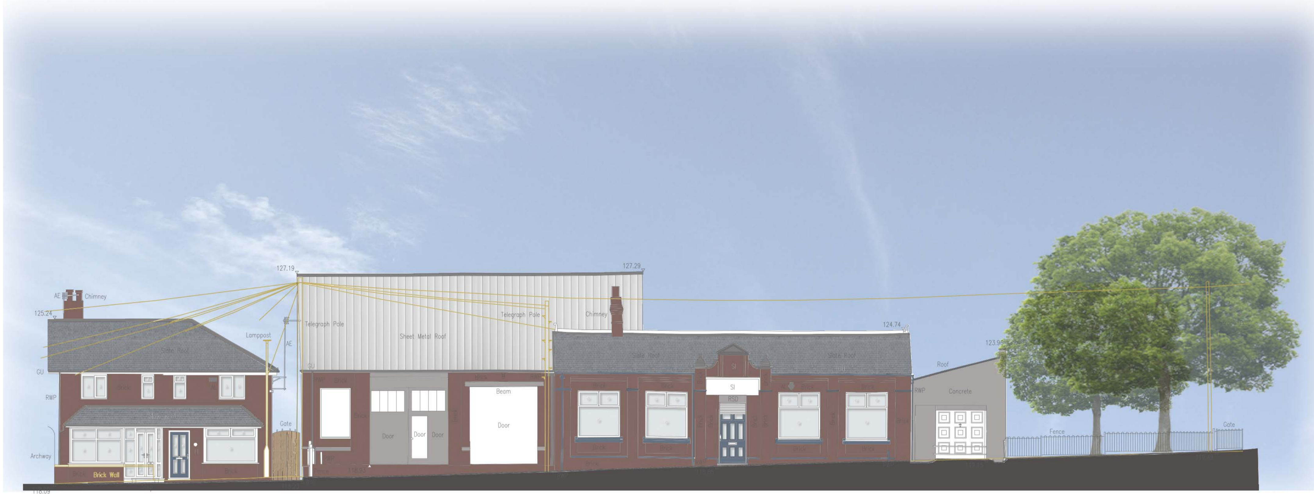
Existing Street Scene