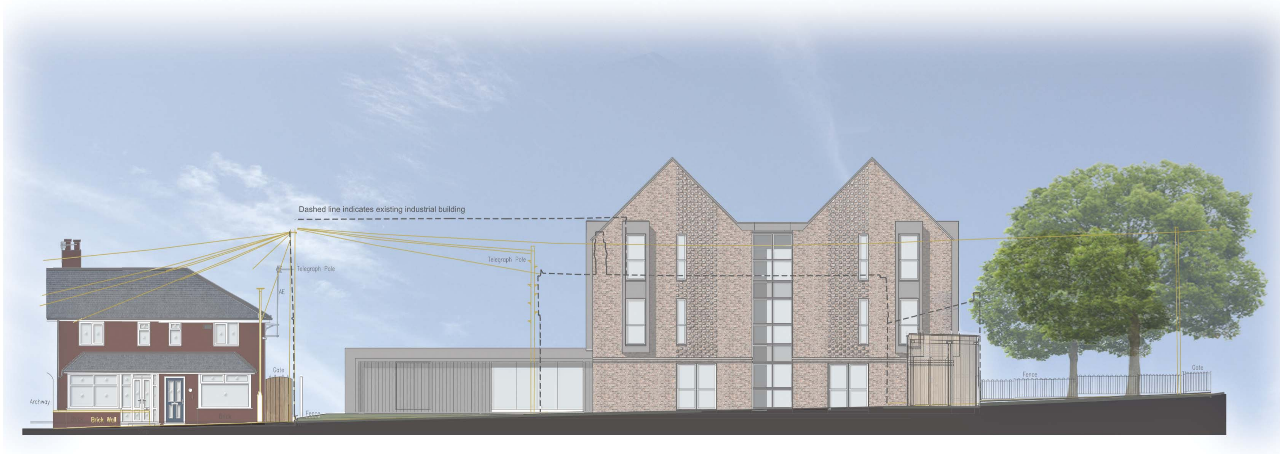
Proposed Street Scene