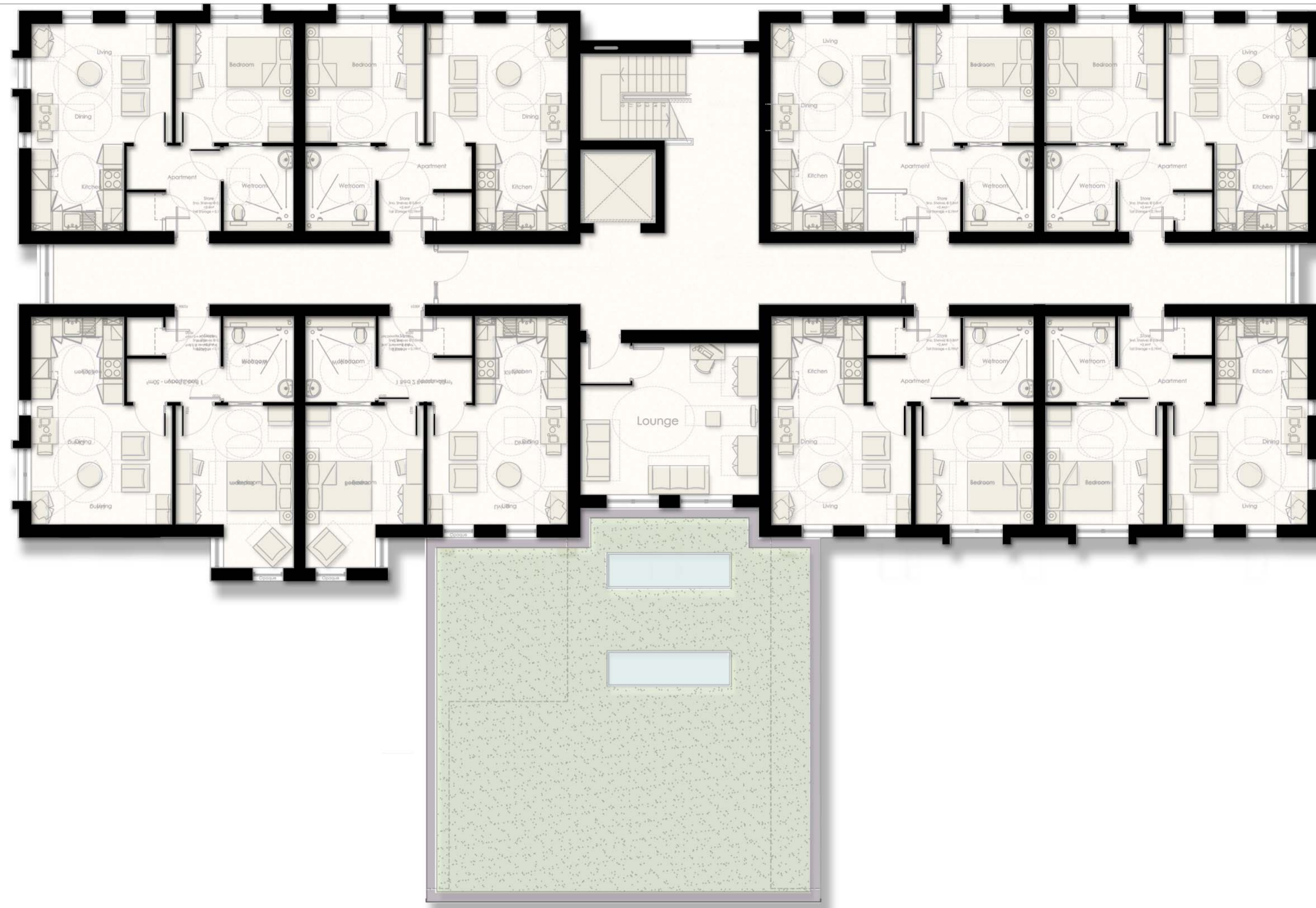
Proposed First Floor Plan 1:100