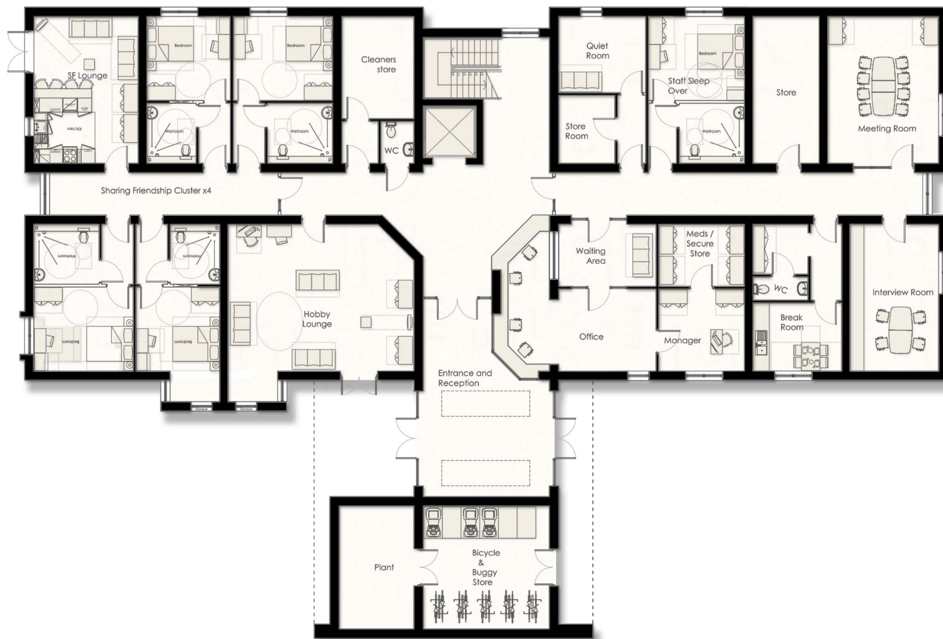
Proposed Ground Floor Plan 1:100