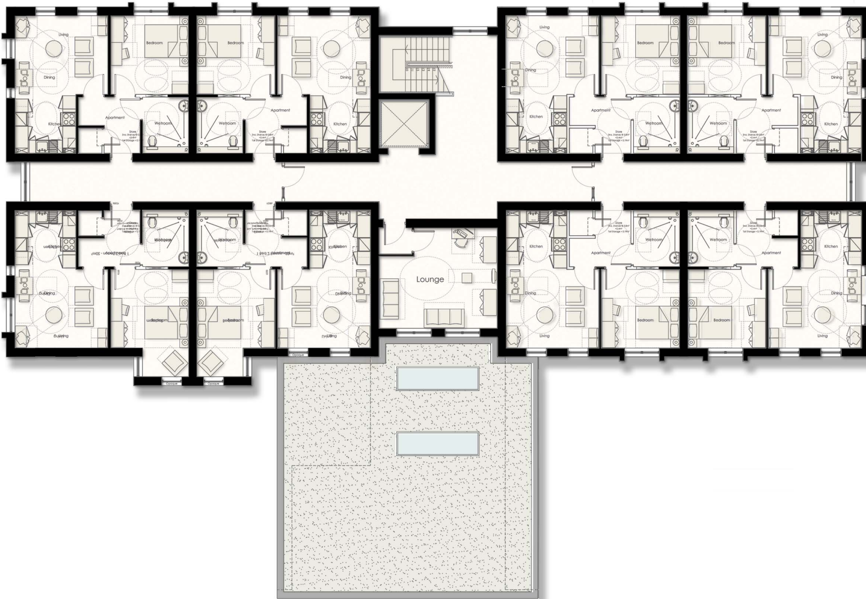
Proposed Second Floor Plan 1:100

Notes Jennings Design Associates take no responsibility for any dimensions obtained by scaling from this drawing. If no dimension is shown the recipient must ascertain the dimension specifically from the Architect or by site measurement. Supplying this drawing in digital form is solely for convenience and no reliance may be placed on digital data. All data must be checked against hard copy. Dimensions must be checked on site. Any discrepancies must be reported to the Architect immediately. This drawing is copyright of Jennings Design Associates.