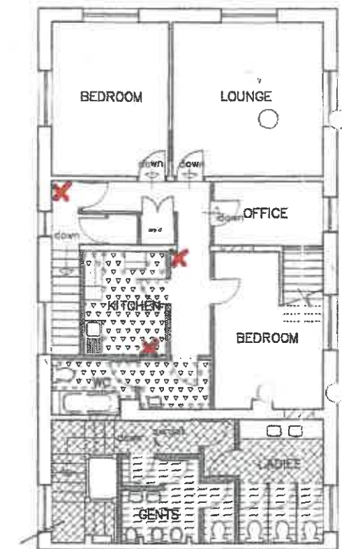
PROPOSED FIRST FLOOR PLAN (1:100)

RED CROSS INDICATES EXISTING FIRE FIGHTING EQUIPMENT