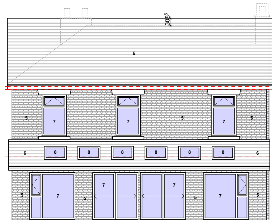
PROPOSED GA REAR ELEVATION