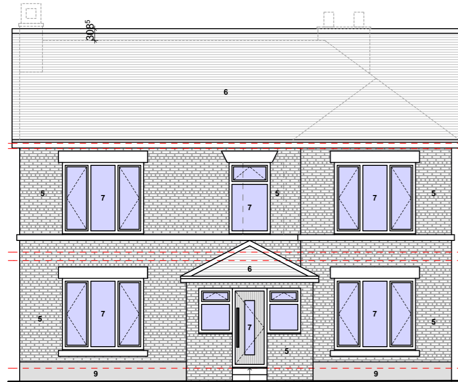
PROPOSED GA FRONT ELEVATION