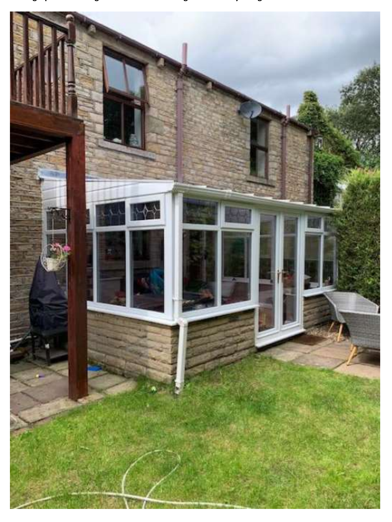
Photograph 1 – Existing rear elevation showing conservatory and garden area